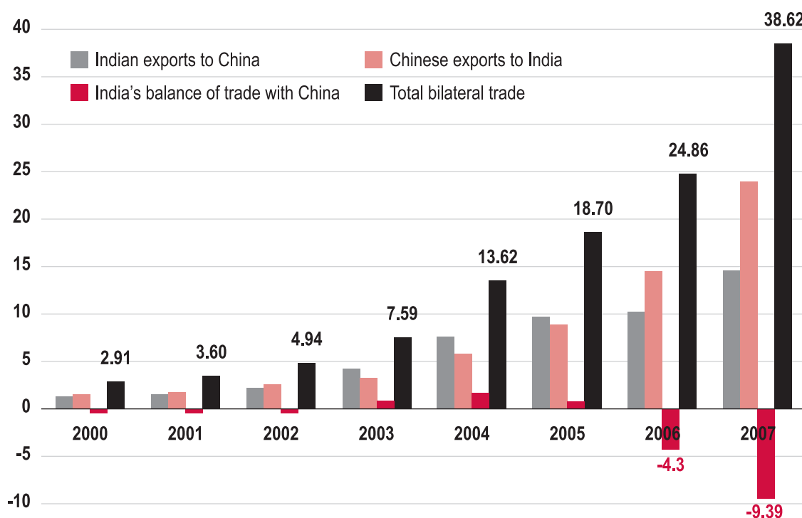
Graph 2. Evolution of India-China bilateral trade (in billions of $)